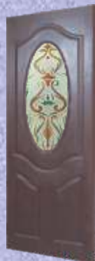
Doors with Glass