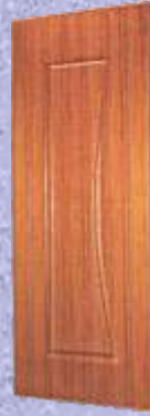
Single Panel Arch Woodgrain Panel