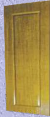
Single Panel Square Woodgrain Panel