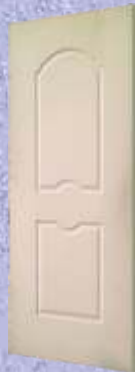
2 Panel Arch Woodgrain Finish