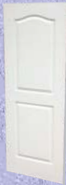
2 Panel Woodgrain Finish