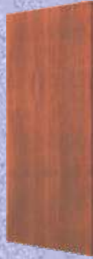
Plain Woodgrain Finish