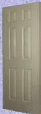
6 Panel Woodgrain Finish