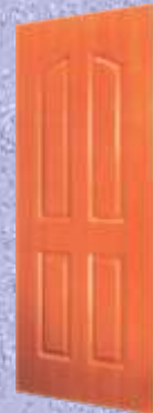
4 Panel Woodgrain Finish