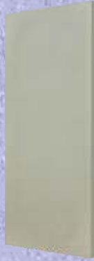
Plain Leather Finish