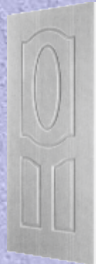
3 Panel Arch Woodgrain Finish