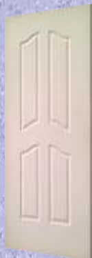
4 Panel Arch Woodgrain Finish