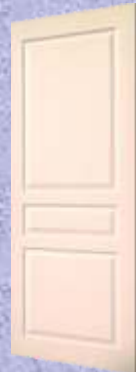
3 Panel Square Woodgrain Finish